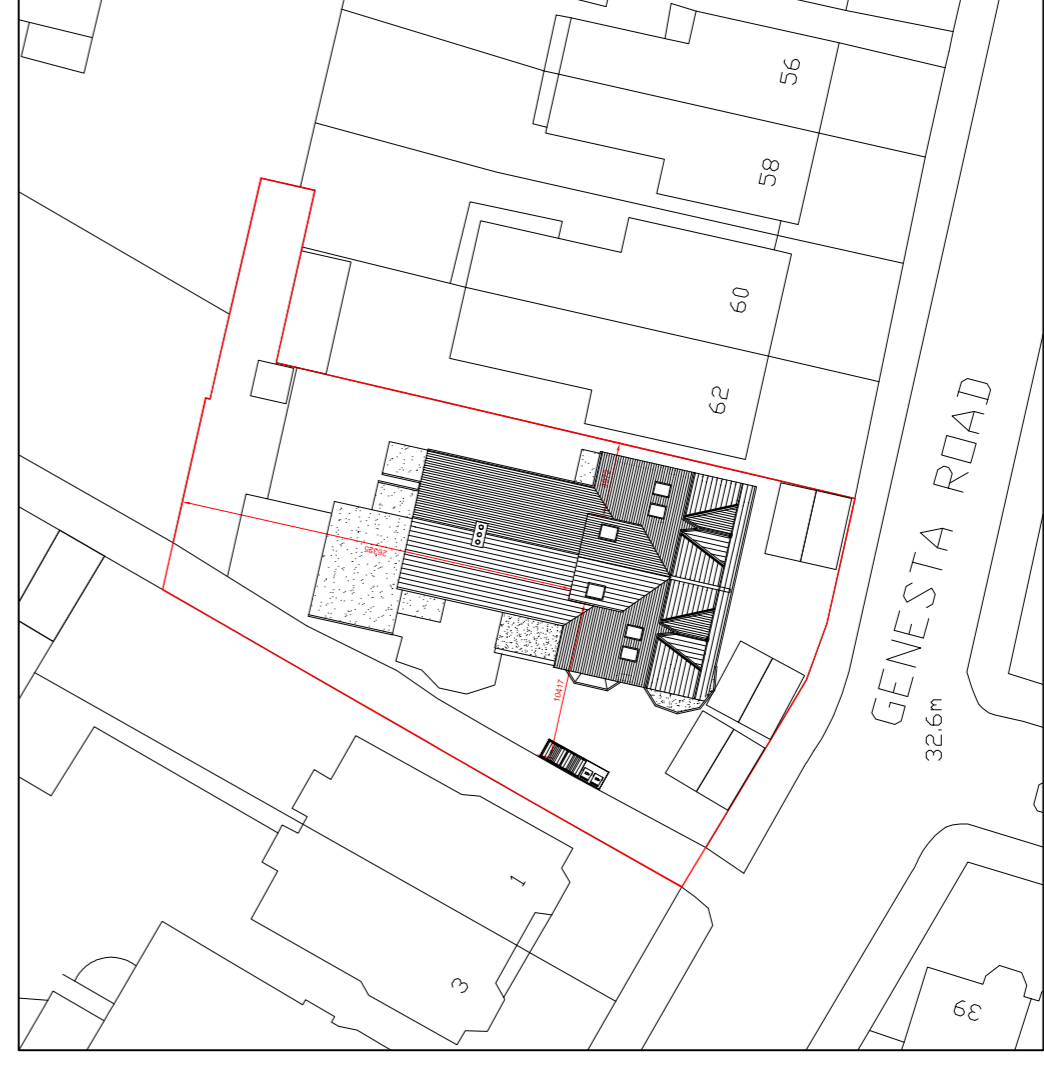
PROPOSED BLOCK PLAN 1:500