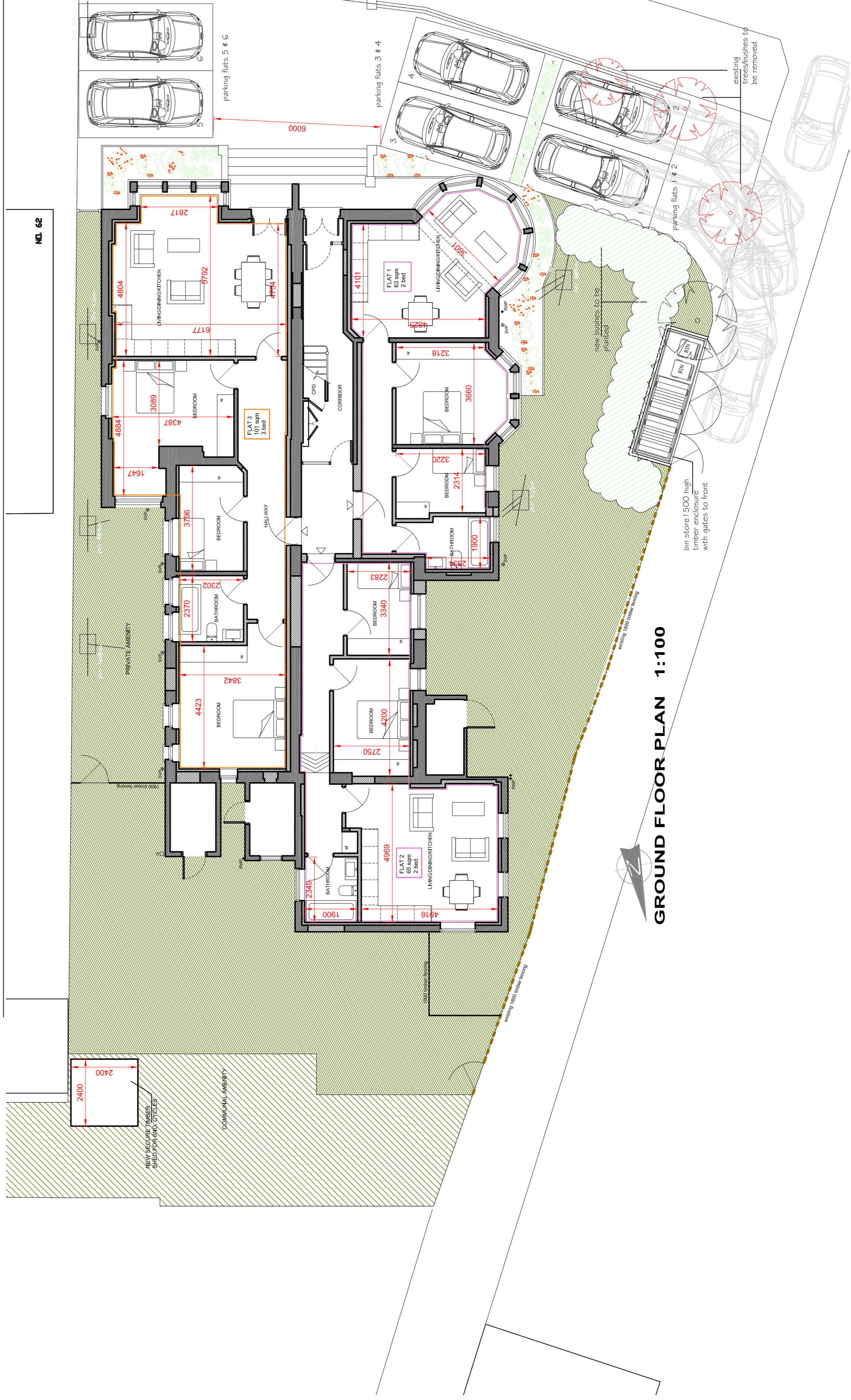
GROUND FLOOR PLAN 1:100